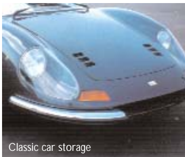
Classic car storage